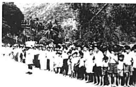
The crowd on the approach to the Protected Place