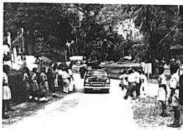
10.44 a.m , 28th December 1955. The Chief Ministers arrive