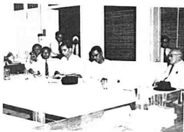
The Government side at the third session