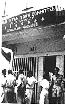
The Town Hall, Klian Intan, where the preliminary meetings between the government envoys and the communist represent gives took place during October, November and December, 1955.