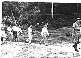
12.30 p.m. 28th December 1955 Chin Peng's party are conducted to their accommodation.