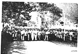
The crowd at the entrance to the Protected Place