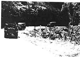
28th December 1955 The journey from Klian Intan to Baling