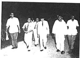
Coming up for the third session