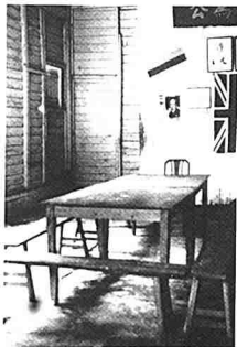
The ground floor of the Town Hall, Klian Intan, showing the furniture and mural decorations. The preliminary meetings actually took place in the room immediately above.