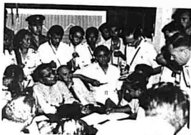
The Chief Ministers give a final press conference in the press room in Baling town before their departure