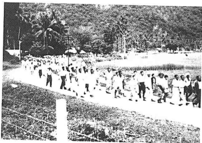
28th December 1955 The crowd arrives from Baling