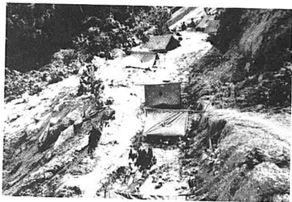
Gunong Paka 29th December 1955 The Police Escort Camp